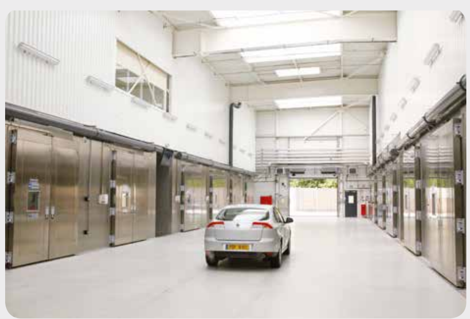
44. Airbag test chamber equipped with a high speed opening and closing door system for quick deployment (7 seconds approx.) of the specimen on a dedicated trolley. 45. Walk-in climatic chambers for corrosion tests on complete vehicles turned-on.